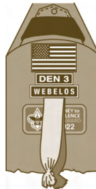
WITH DEN NUMERAL