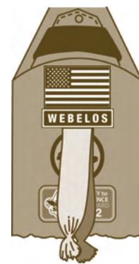
WITH DEN EMBLEM