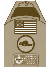
WITH DEN EMBLEM