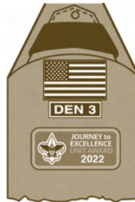
WITH DEN NUMERAL